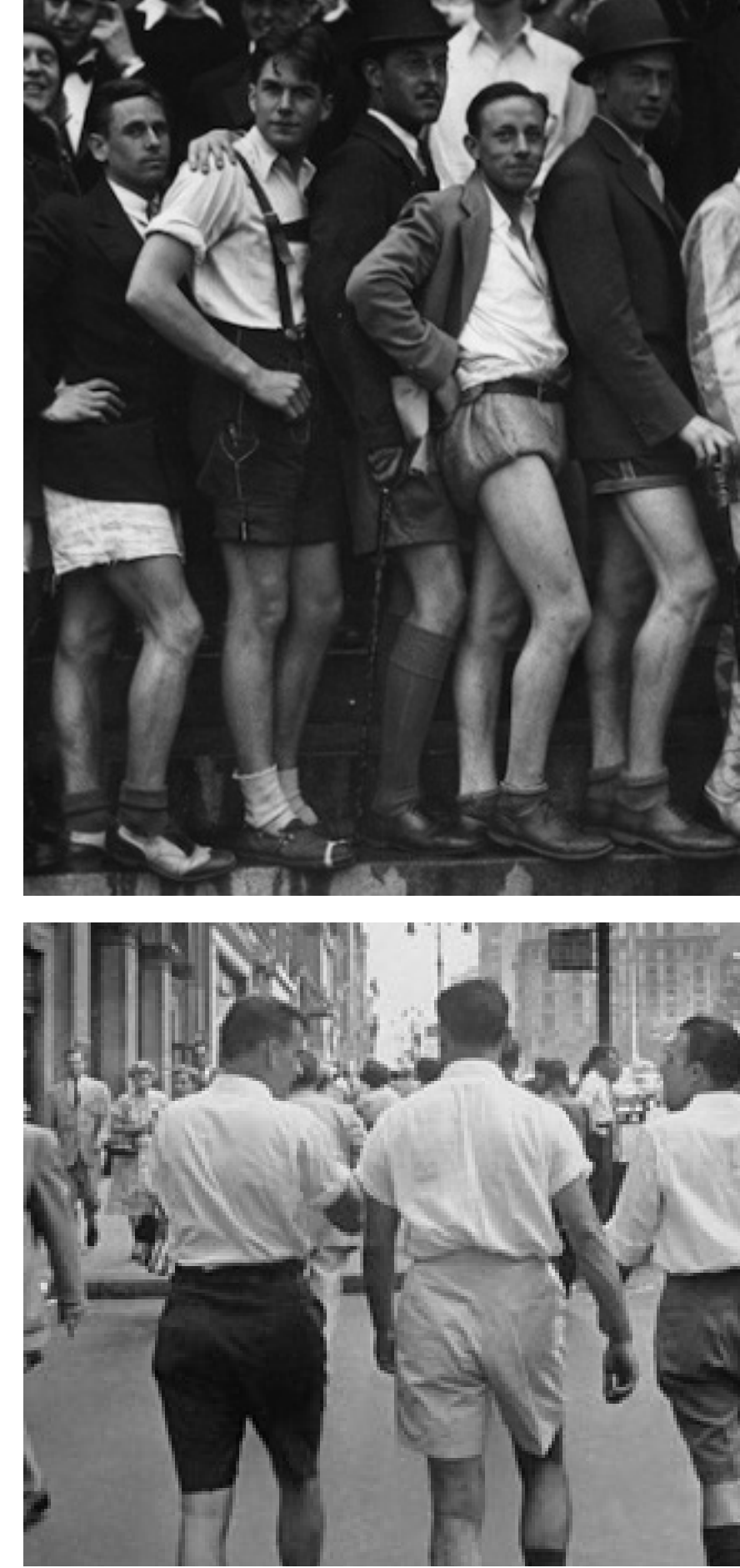
shorts as being only for young boys took several decades to change, and to some extent still exists in certain circles. By the late 20th century it had become more common for men to wear shorts as casual wear in summer, but much less so in cooler seasons.

Since about the time of World War II, when many soldiers served in tropical locations, adult men have worn shorts more often, especially in summer weather, but the perception of