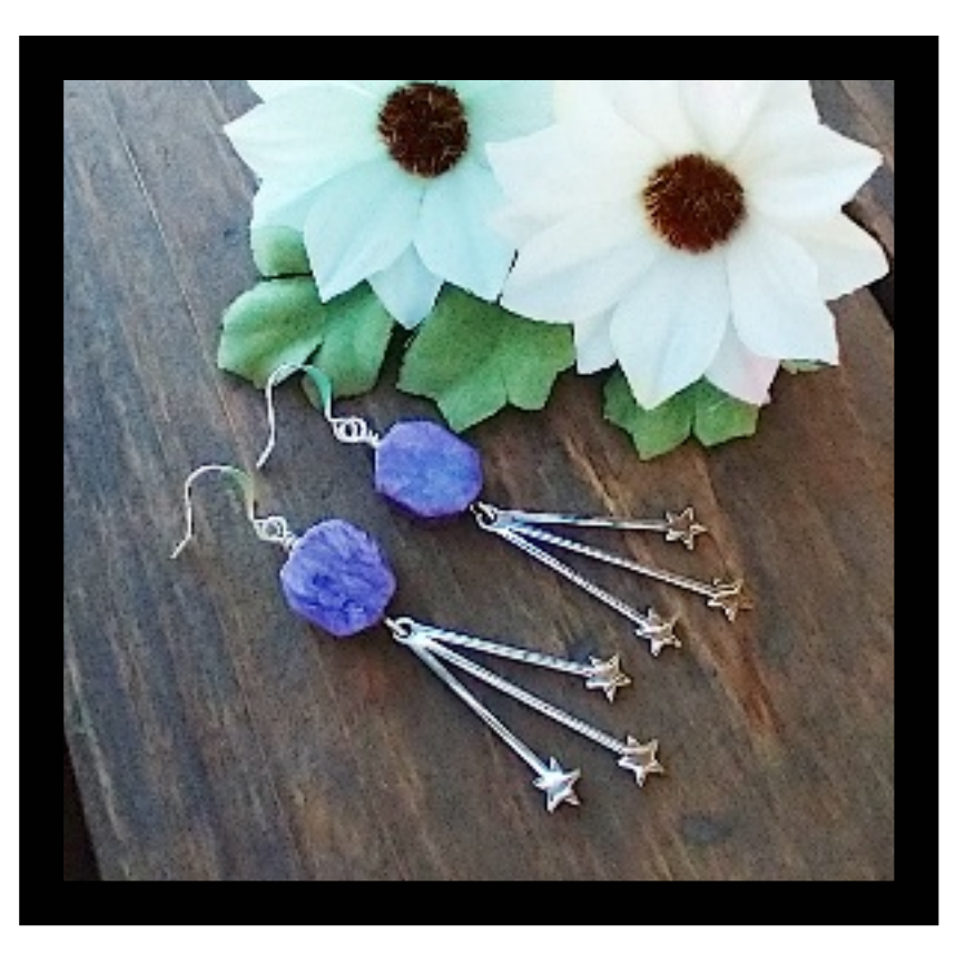
Article & Photos By Crystal Hamlin